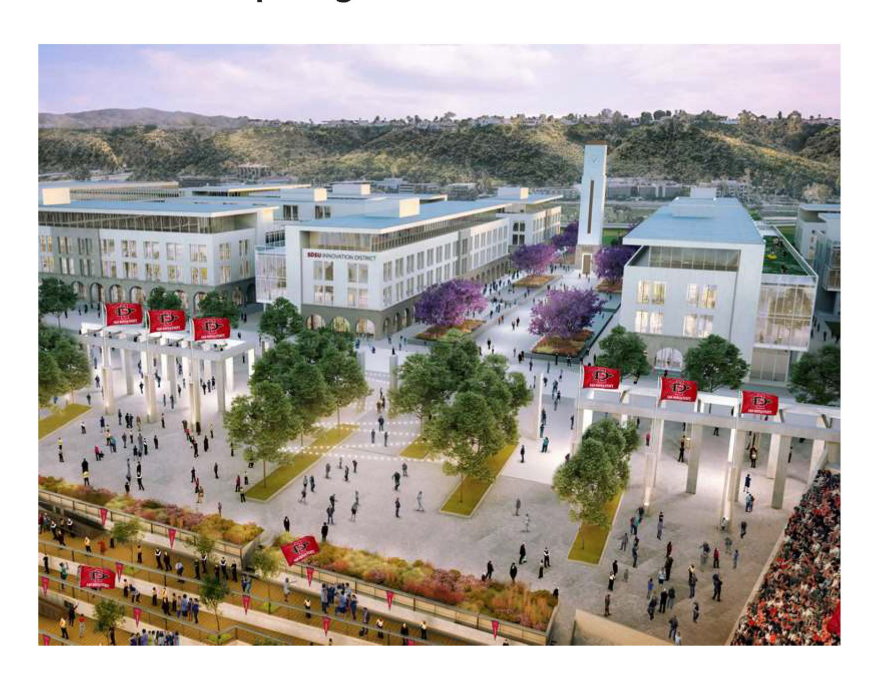
San Diego State University's Mission Valley Innovation District

San Diego State University (SDSU) is in the process of building an Innovation District – roughly 1.6 million square feet of office, technology, and research space. Developed primarily through public-private partnerships, the incubator-like SDSU Innovation District will facilitate internships, create new educational experiences, inspire innovative discoveries, advance technology, and foster new research.