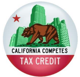
EXHIBIT B FIRST AMENDMENT TO AGREEMENT