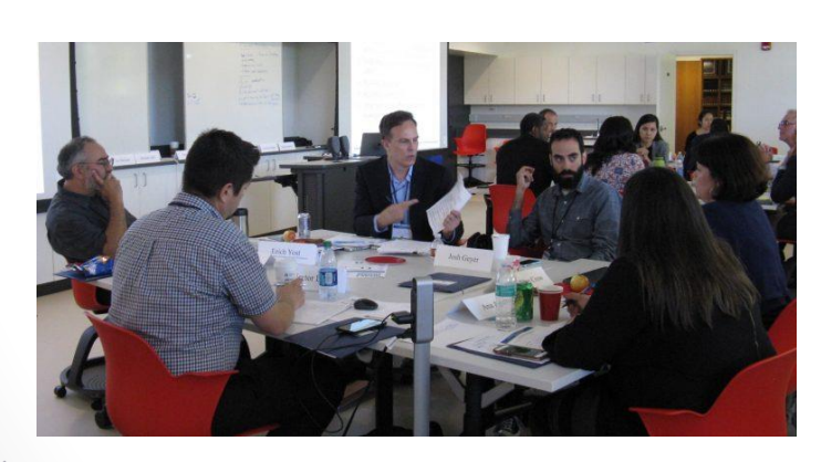
California Affinity Group