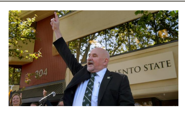
Sacramento State University/Downtown Campus