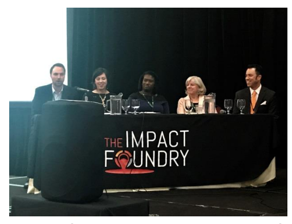
Financial Institution Partnership Opportunity/The Impact Foundry