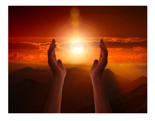
Faith Based Initiative