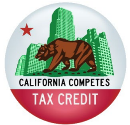
EXHIBIT B FIRST AMENDMENT TO AGREEMENT